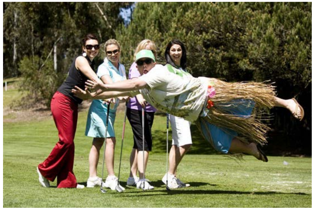
Thank you to all of our sponsors and golfers who helped make this our most successful tournament yet! <u>Click here</u> to see more pictures and a full list of all of our winners.