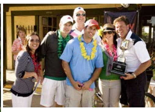
Golfers having fun out on the course.