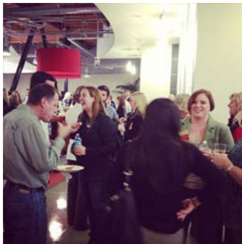
Our best CREW Who? turnout ever!