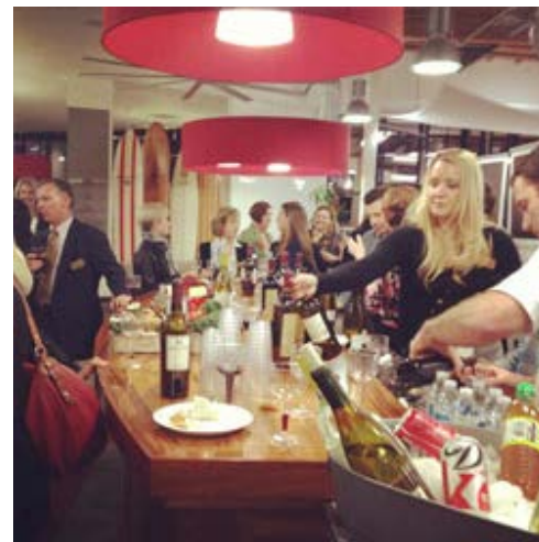
Thanks to our host DPR Construction for a great venue