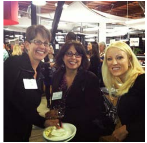
Enjoying an evening of great friends and colleagues