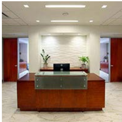
JLL Lobby Remodel